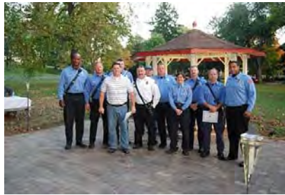
Fire/EMS Fire Station #1